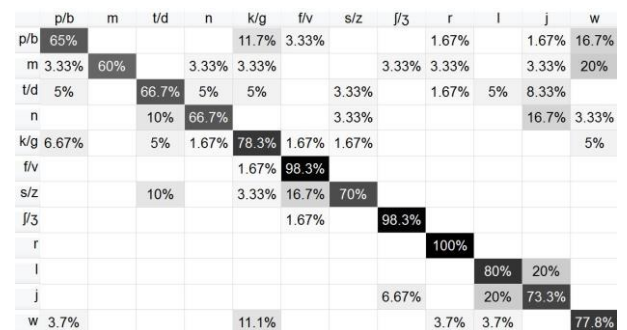
Figure 2: Consonants confusion matrix for the articulatory-to-acoustic (listening test).